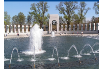
World War II Memorial